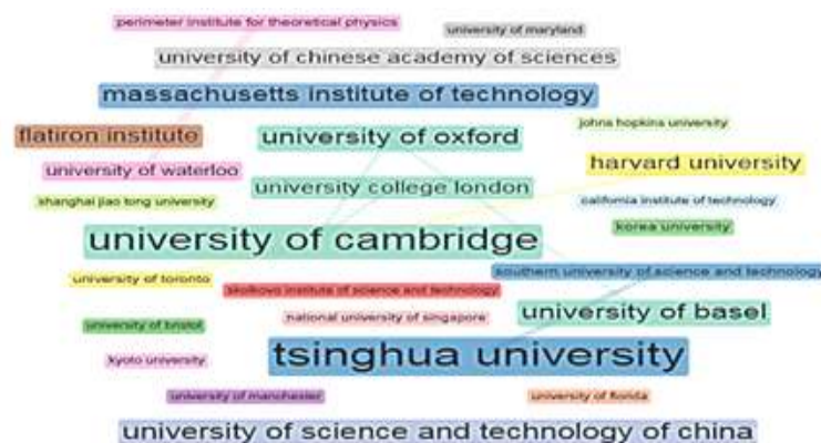
Fig. 3. Institutional collaboration network

The top 25 most productive organizations collaborated in QML research; their collaborative linkages varied from 23 to 101. The collaborative linkages between one-to-one organizations varied from 1 to 25. University of Waterloo, Canada and Perimeter Institute of Theoretical Physics, Canada both registered the highest number of collaborative linkages (14 each), followed by Argonne National Lab., USA, and University of Basel, Switzerland (6 each), Tsinghua Univ. China - Southern University of China, China and Harvard University, USA - University of Toronto, Canada (5 each), ETH, Zurich - Univ. of Oxford, U.K. (4 each), etc. A collaborative networks chart of top 25 organizations is presented in Fig. 3. The node indicates the number of publications, the more the number of publications the larger the node size. Tsinghua University tops in the list with most collaborative publications, followed by University of Cambridge.