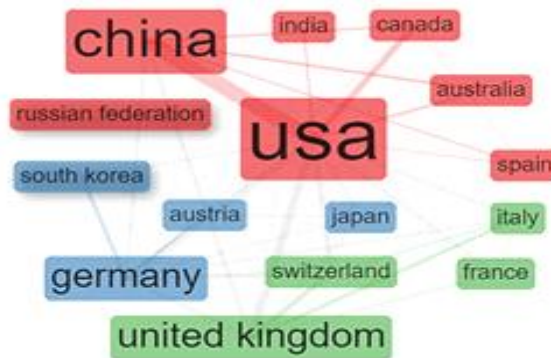
Fig. 1. Country collaboration networks chart

the countries and the distance between them represents the degree of their research collaboration. The bigger the diameter of a network node and its font size, the bigger its weight in research collaboration. The USA dominates in QML collaborative research, followed by China, Germany, the UK, and others.